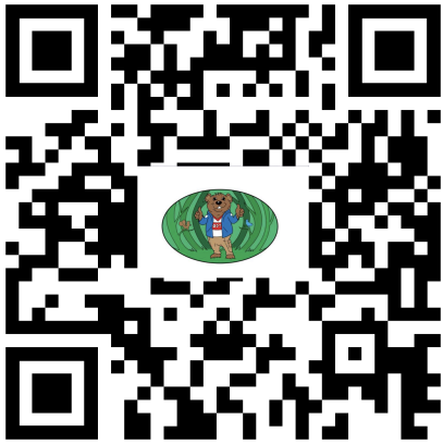
Story Time Gruffalo Song