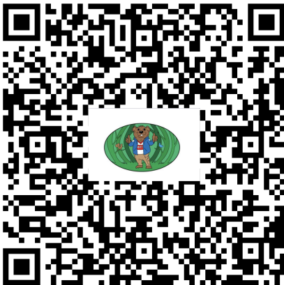
Exercise Premier League Warn Up