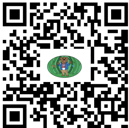
Action Dance Shake Your Silly Out