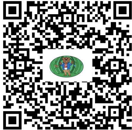
Family Activity Garden Bird I.D