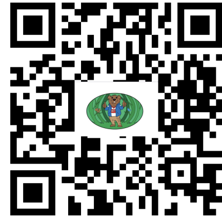
Activity The Best Paper Aeroplane