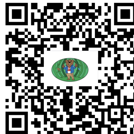
Education Maths & English Game