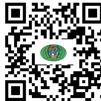
Action Dance - Footloose