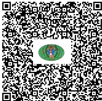
Activity Yorkshire Water Activity Book