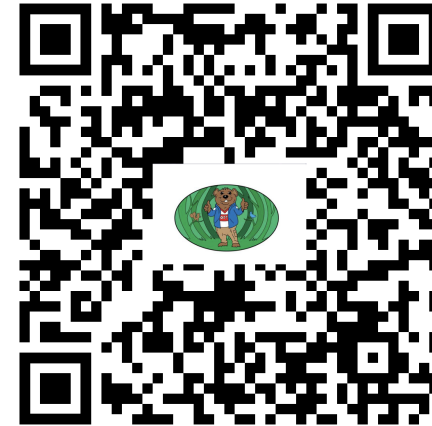
Family Activity Find Forky